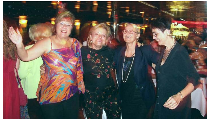
The AFGLC Tampa Center Fall Dinner-dance Cruise on the yacht Starlite Majesty (See Pg. 8)