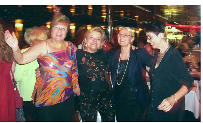
The AFGLC Tampa Center Fall Dinner-dance Cruise on the yacht Starlite Majesty (See Pg. 8)