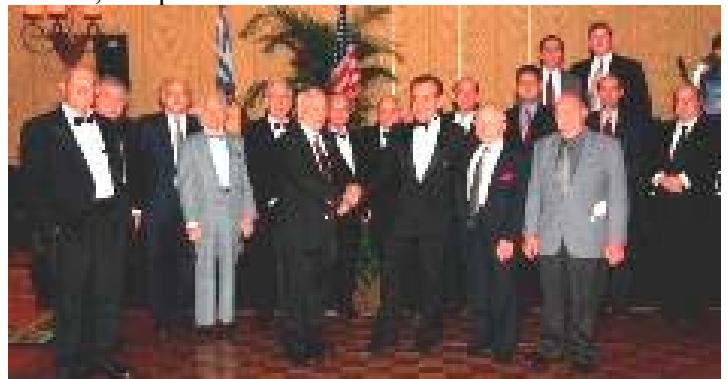
A Group photo of the AFGLC officers and some key participants at the Gala 2005